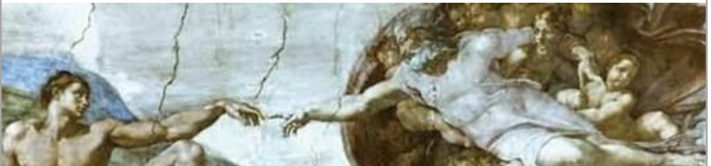
Portion of Sistine Chapel: Creation of Adam

The Roman centurion (commander over a hundred soldiers), in witnessing the crucifixion of Jesus, said, "Surely this man was the Son of God!" (Mark 15:39, page 722)