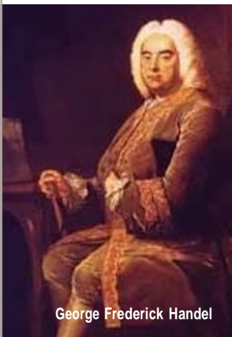
George Frederick Handel

THE ARTS: Michelangelo’s Sistine Chapel , in Rome, is considered one of the greatest masterpieces.